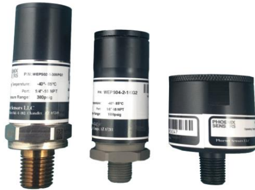
SMALL SMALLER SMALLEST!!