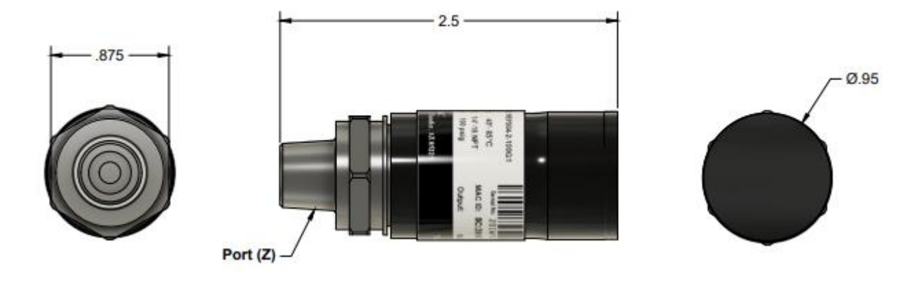
Pic. 1 - Battery Option