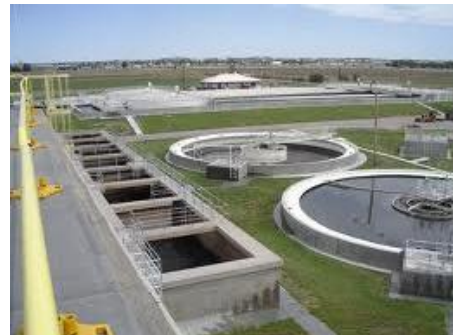
City Waste Water

Many different cable length options are available to the customer. This allows for flexibility when measuring at different depths of the selected media.